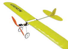
Pico J3 Stick