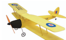
Tiger Moth 400