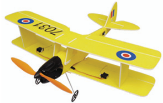
3D Tiger Moth