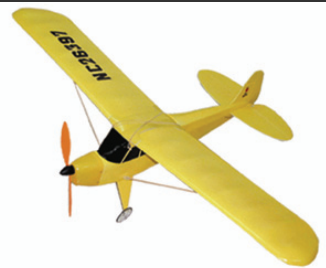
Pico J3 Piper Cub