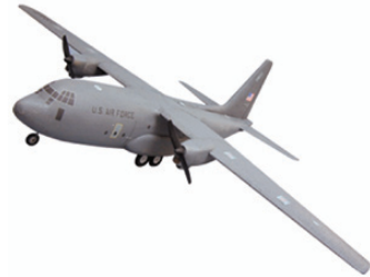
Cargotrans EDP Twin