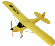
J3 Piper Cub