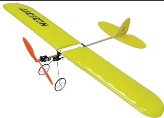
Pico J3 Stick