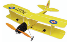
3D Tiger Moth