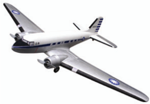
C47 Mayling Soong