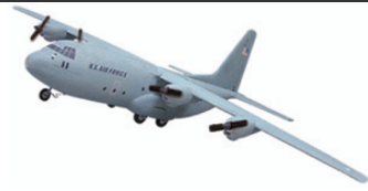
Cargotrans EDP Quad