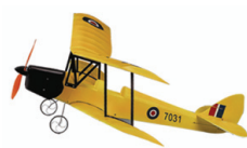
Pico Tiger Moth