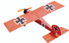
Pico Stick F